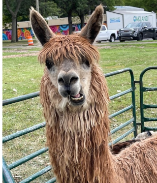
Activities include a petting zoo.

People for Palmer Park Harvest Festival - Detroit, Michigan